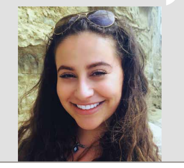
I have found many opportunities at the U that are setting me up for success in my future career.