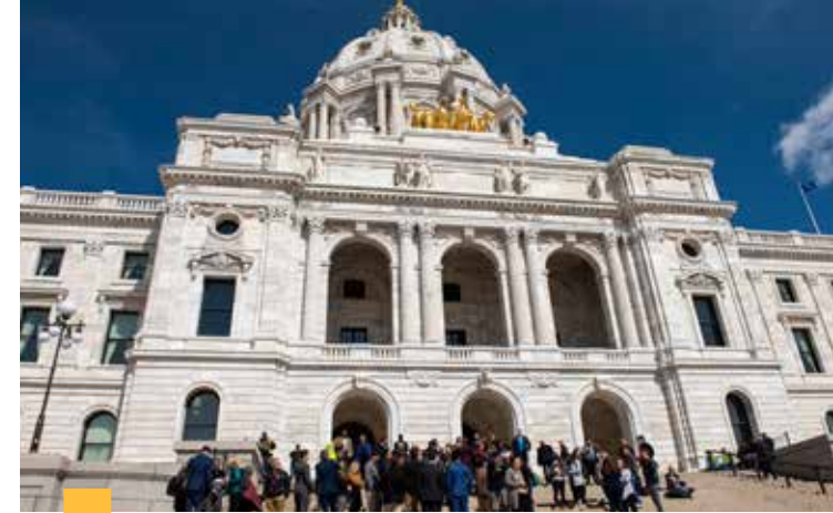
University of Minnesota students and staff visited the state capitol. They met with legislators to share the importance of the University to the state.

The Twin Cities area is full of vibrant cultural communities. With 126 languages and dialects, close-knit neighborhoods, and hundreds of traditional and international performances, you'll experience the benefits of our Minneapolis-St. Paul location.