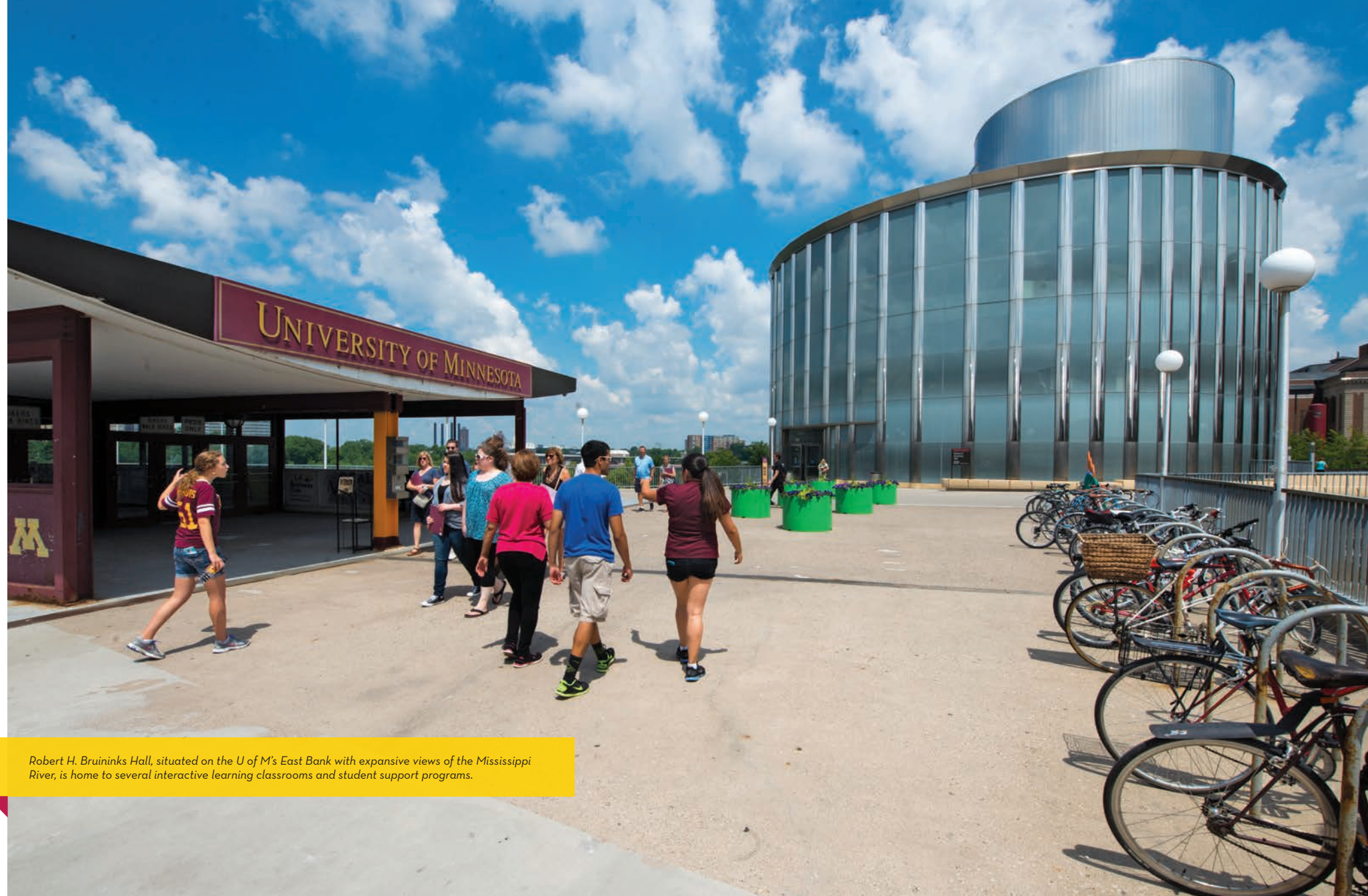
Robert H. Bruininks Hall, situated on the U of M's East Bank with expansive views of the Mississippi River, is home to several interactive learning classrooms and student support programs.

MAJORS: Kinesiology, Physical Activity and Health Promotion, Sport Management