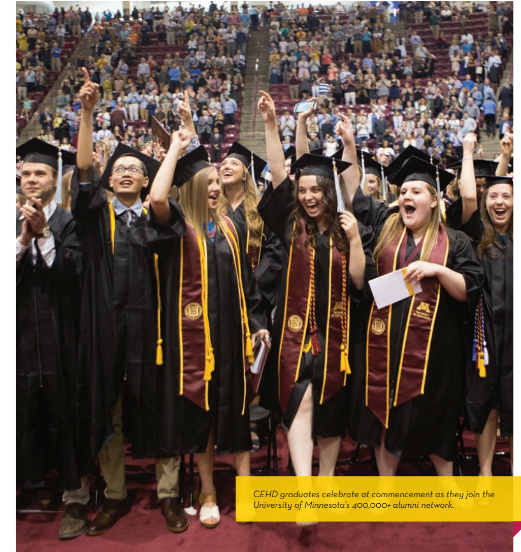
CEHD graduates celebrate at commencement as they join the University of Minnesota's 400,000+ alumni network.